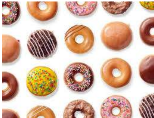
Doughnuts (Breadus deliciousa)