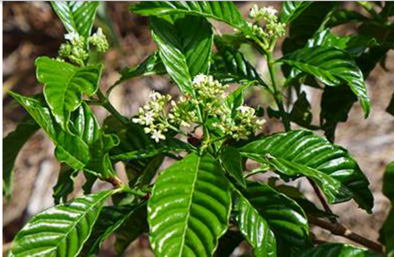
Wild coffee ( Psychotria nervosa )