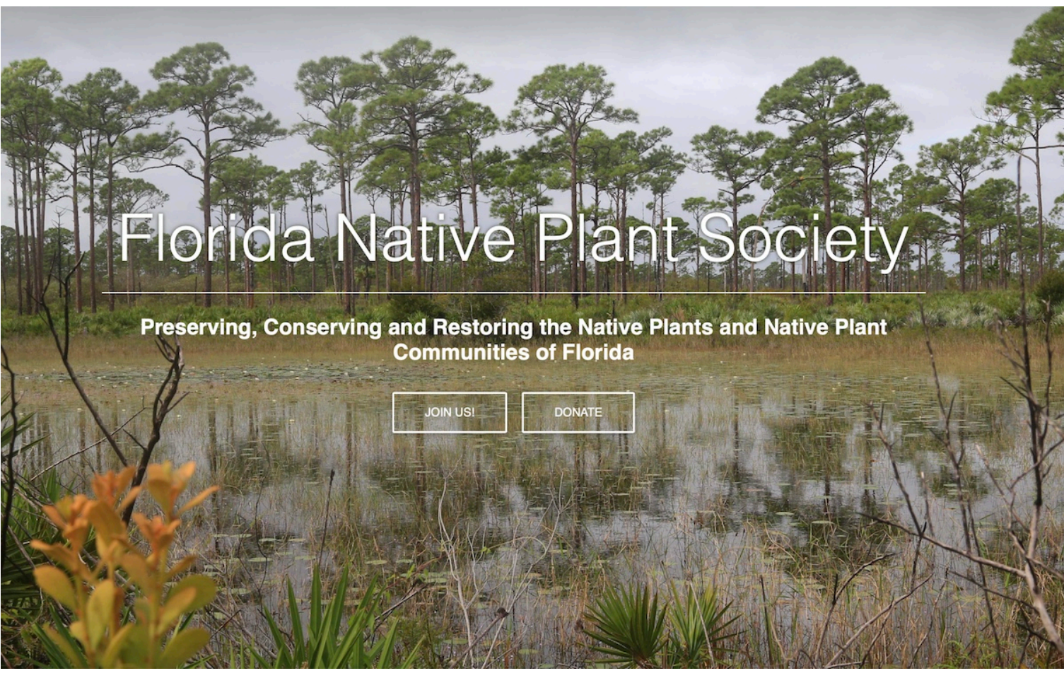
Screen shot of the new Florida Native Plant Society Website

Spanning from day to night and from sunshine to rain and wind, "Story of Flowers" shows the various stages of botanical growth and the help plants get along the way in less than 4 minutes! Turn on the volume, click the link and enjoy!