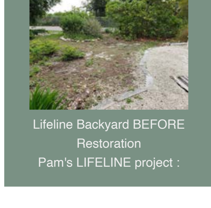
Lifeline Backyard BEFORE Restoration Pam's LIFELINE project :