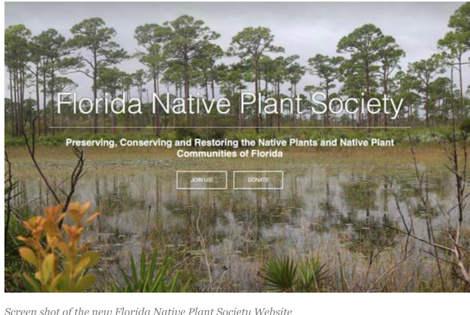
Screen shot of the new Florida Native Plant Society Website