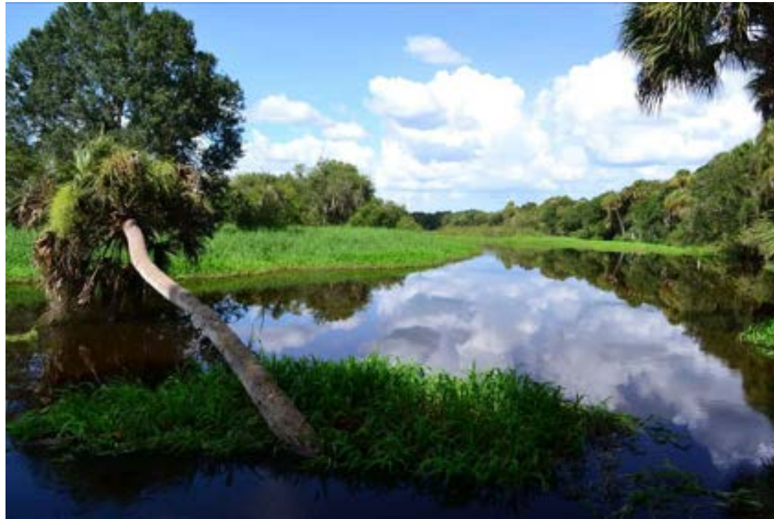
Myakka River, above, at Myakka River State Park.

Click here to register for the MRSP field trip July 9